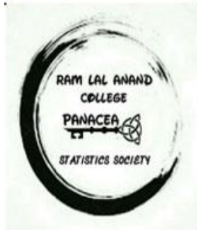
LOGO of PANACEA-Statistics Society