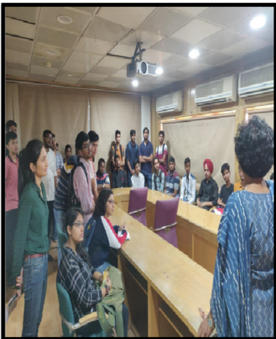
Career Counseling Session by Alumni