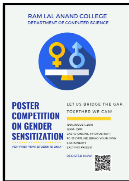
Poster Making Competition on Gender Sensitization