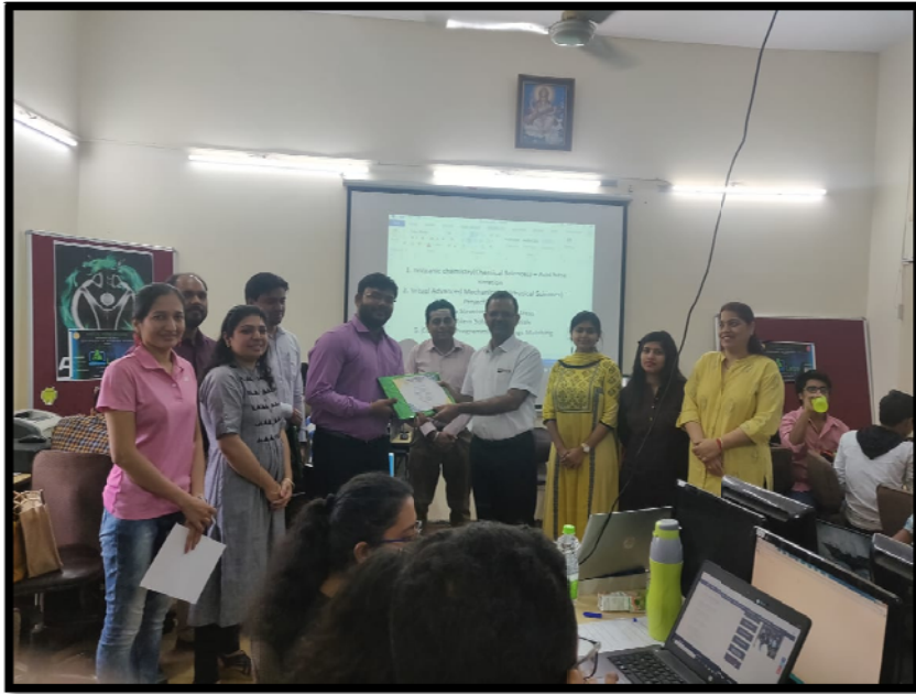
Workshop on Virtual Labs, IIT Delhi