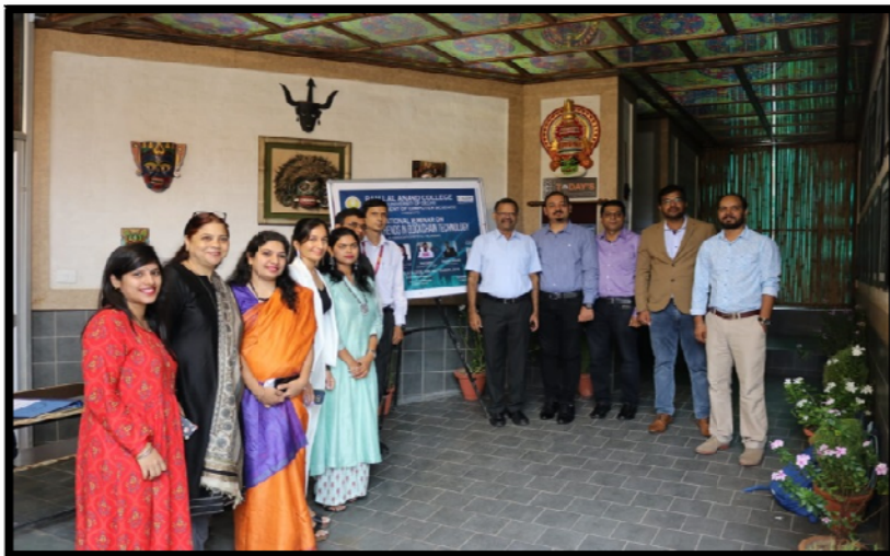
National Seminar on Blockchain Technology