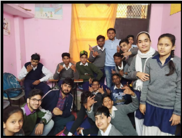
1 week Outreach Activity