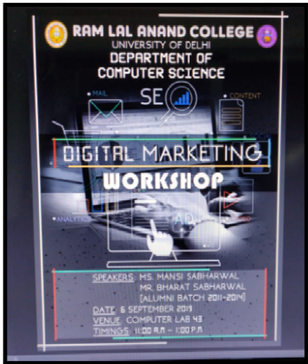
Workshop on Digital Marketing