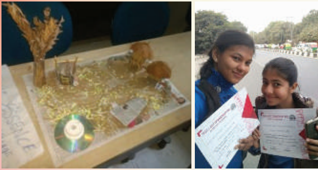
Ist prize in Sri Aurobindo college annual fest Mehak 2017