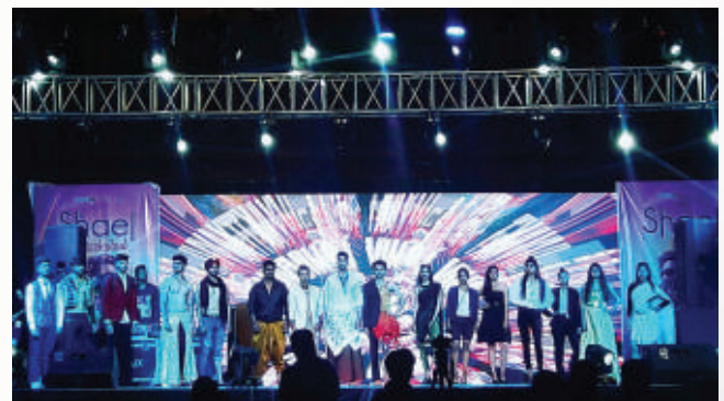
Fashion Performance at Bharti College, DU