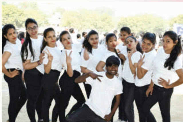
Illusion performs on College Sports day

They have been practicing for hours and participating in various fests. The team specializes in Jazz and hip-hop. We wish all the luck to all the students of society for their bright future ahead.