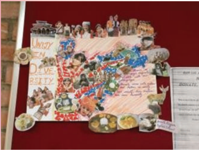
In-house poster competition