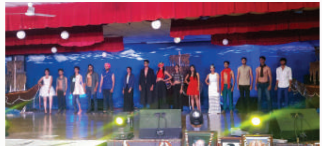
Fashion Performance at Lingaya’s Institute

The society members respect their art in full vigour. Till now, they have competed and won accolades in various fests like ABHIVYAKTI [Bharti College], and Lingaya’s Institute. Though, they achieved so much in such a short span of time, the society and its members still have a long way to go.