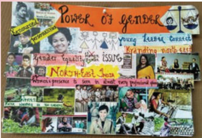
In-house poster competition