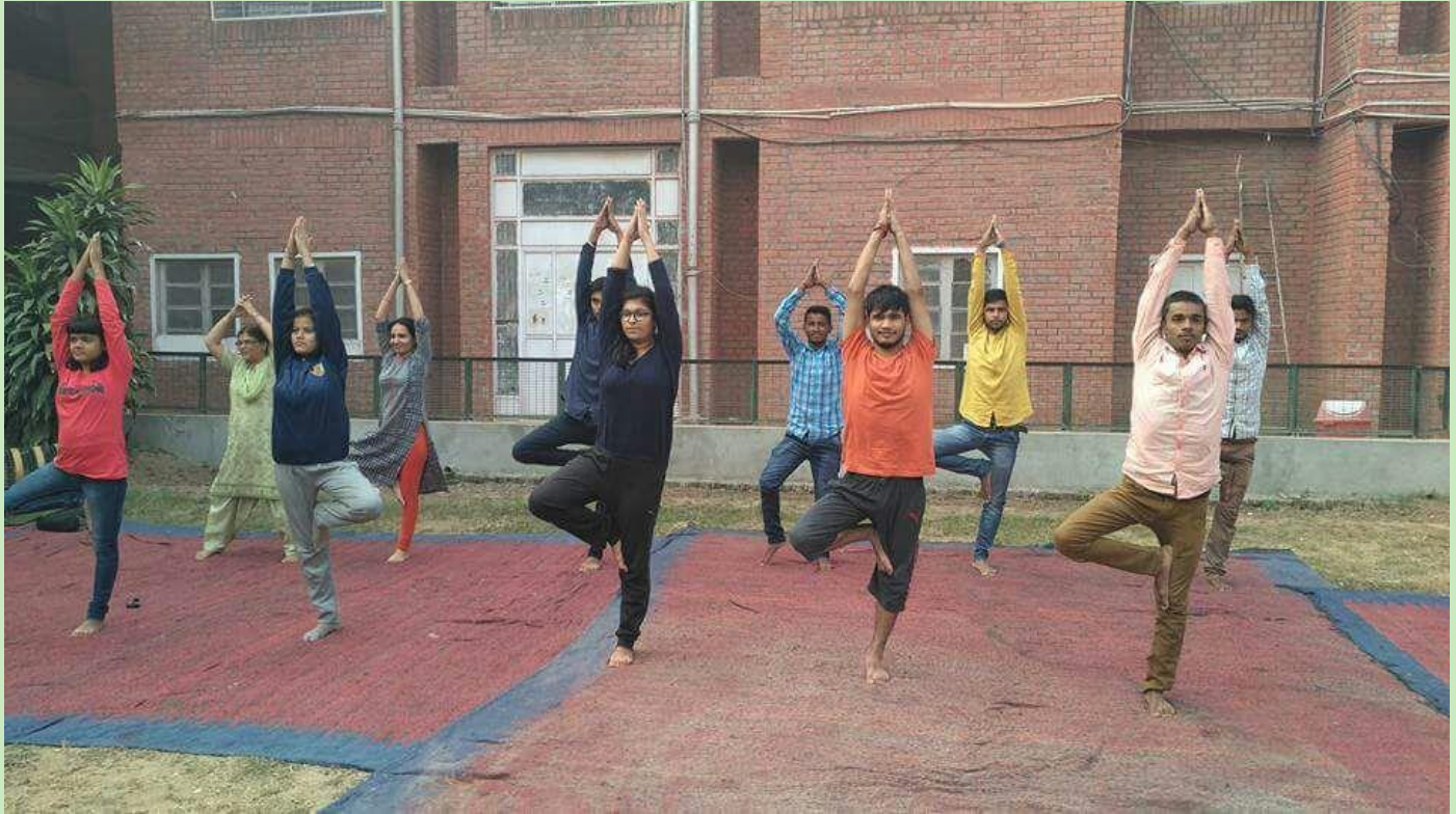
*Students and teachers performing Yoga in College