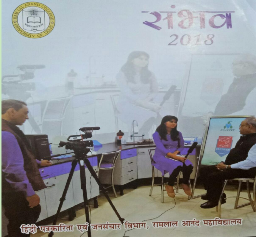
हिंदी पत्रकारिता एवं जनसंचार विभाग, रामलाल आनंद महाविद्यालय