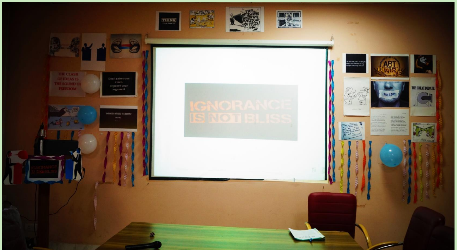
*The set-up before a Debate and Quiz competition in college

Under the banner of the society, quizfest named Qrukshetra , Debate Competition titled Ignorance is not bliss , and Slam Poetry Competition labelled Bol Ke Lab Azad Hai Tere , are the highlights of annual events organised in the college. The team of Quizzers, Debaters and Slam Poets, also participate in inter-college events and win accolades for the college.