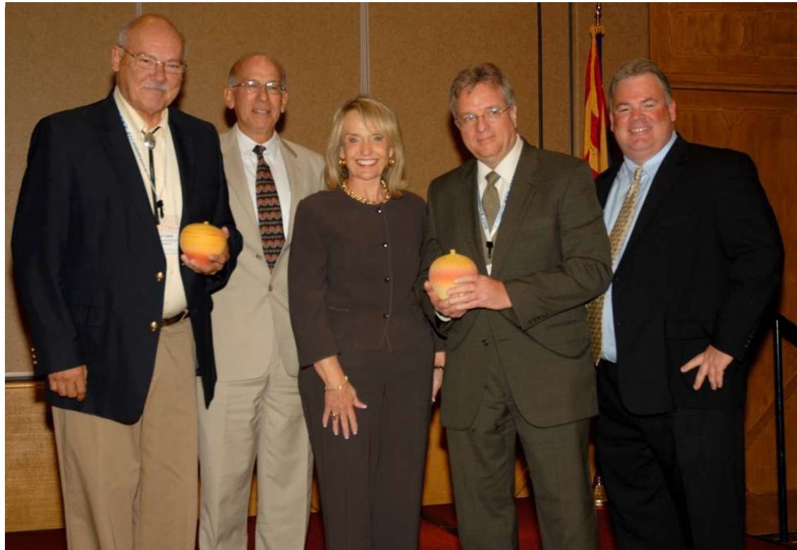
2009 Governor's Excellence Award for Innovative Economic Development